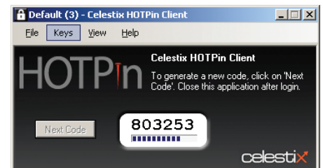
HOTPin Client for Standard Win32 Software Devices