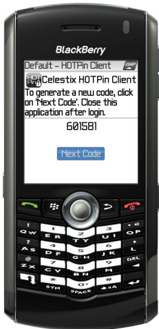
HOTPin Client for RIM BlackBerry

HOTPin puts OTPs on mobile phones two ways: clientless mode and client mode. In clientless mode, the HOTPin server application generates OTPs and sends them via SMS text messages to users' mobile phones or PCs. Clientless mode is perfect for users who don't have smart phones. For client mode, users download HOTPin client software to their smart phones or PCs. HOTPin client software generates OTPs directly on the smart phone or PC. The advantage of client mode is that it delivers OTPs regardless of wireless reception. HOTPin also has a Windows client you can install on PCs to deliver OTPs directly to the desktop. Here are the clients HOTPin currently supports in client mode: