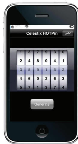
HOTPin Client for Apple iPhone